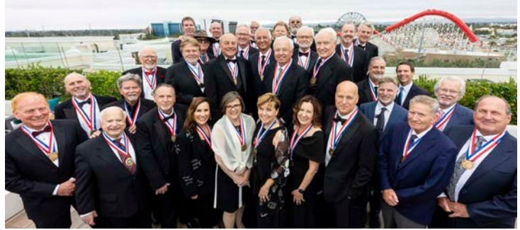
2023 Hall of Fame VIP Reception