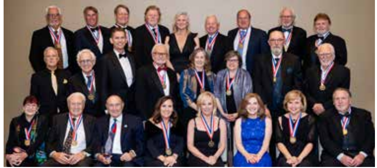
2024 Hall of Fame VIP Reception